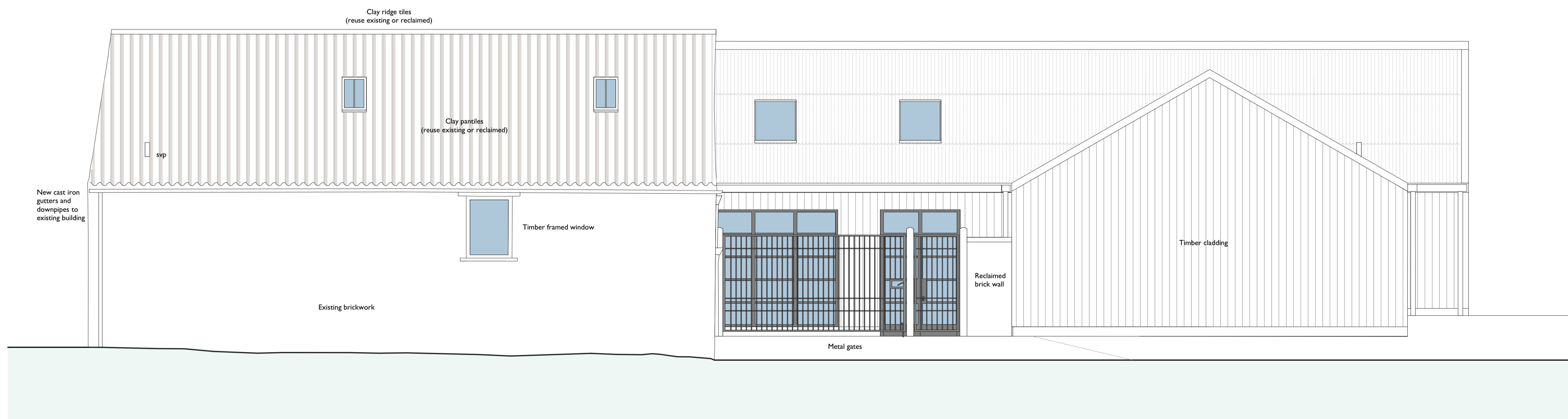
2 SOUTH - EAST ELEVATION Scale: 1:50