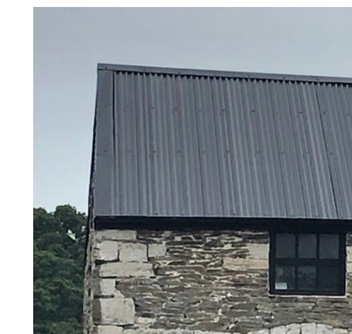
3inch corrugated matt black roofing sheets