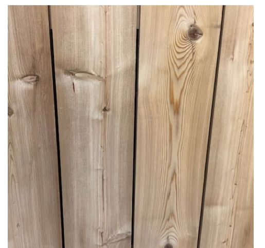
150mm vertical timber cladding boards