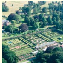
Scapston Walled Garden